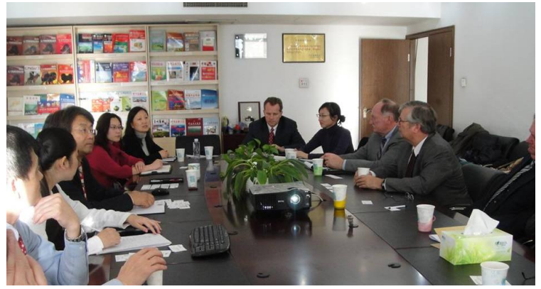
The U.S. delegation meets with the China Animal Agriculture Association to recognize the CAAA's 10th anniversary