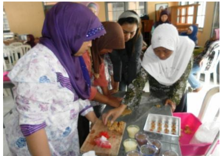
Participants working to develop new and tasty tempe products