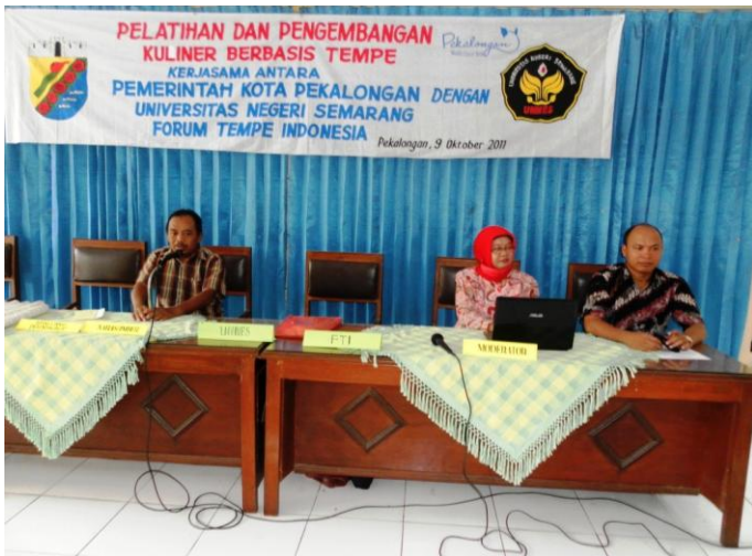
Maskar (R) facilitates the training session of the seminar

South Asia is one of the top consumers of soybeans, including U.S. soybeans, worldwide. Tempe and tofu are the main soy products consumed in the region. USSEC looks to continue to increase human consumption and demand of soy through seminars and product diversification.